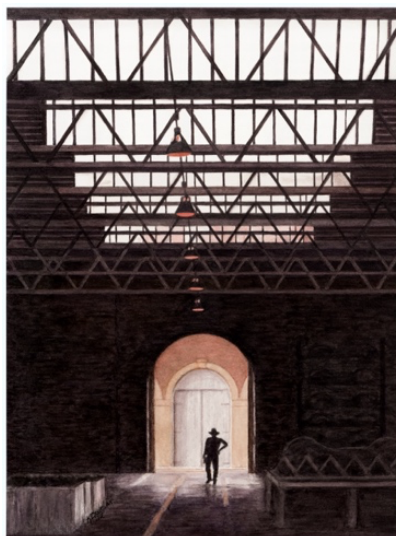
Supervisor (2022) Watercolour on paper, 48 x 39 cm framed $900

Also available: Limited edition giclee print, edition of 40, signed and numbered by the artist, archival ink on Hahnemuhle Photo Rag 188gsm, 76 x 61 cm $380