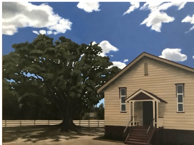
Sunday Service (2022) Acrylic on canvas, 45 x 61 cm $1200