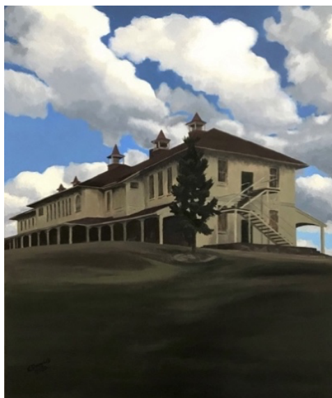
Lost at the Asylum (2020) Acrylic on canvas, 61 x 51 cm $1300