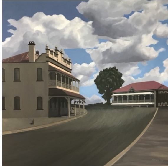
The Day After (2021) Acrylic on canvas, 96 x 96 cm $3800