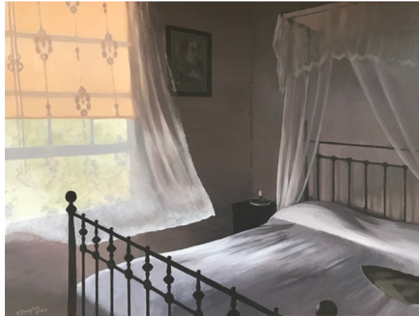
Home at Last (2022) Acrylic on canvas, 51 x 61cm $1300

Also available: Limited edition giclee print, edition of 40, signed and numbered by the artist, archival ink on Hahnemuhle Photo Rag 188gsm, 51 x 61 cm $300