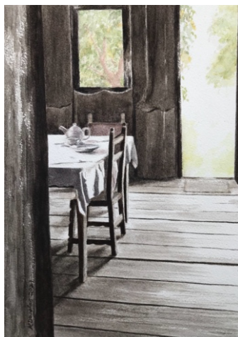
Tea (2021) Watercolour and ink on paper, 40 x 32 cm framed $700