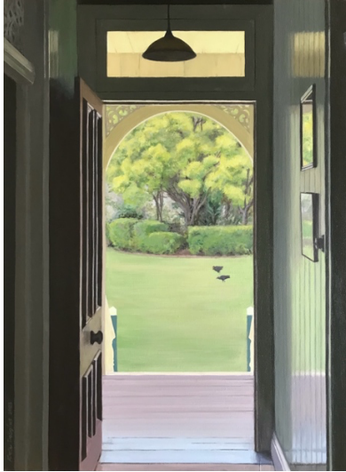
Saturday Afternoon (2023) Acrylic on canvas, 61 x 45 cm $1100