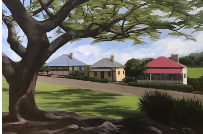
Halfway down the Hill (2023) Acrylic on canvas, 51 x 76 cm $1600

Also available: Limited edition giclee print, edition of 40, signed and numbered by the artist, archival ink on Hahnemuhle Photo Rag 188gsm, 76 x 61 cm $380