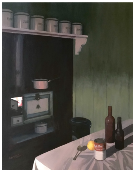
Friday Evening (2022) Acrylic on canvas, 76 x 61 cm $1900