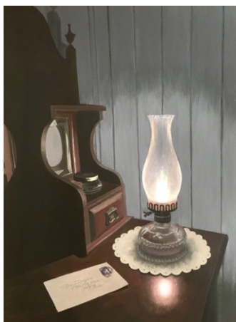
News from Afar , (2023) Acrylic on canvas, 61 x 45 cm $1100

This project is supported by the Queensland Government and Ipswich City Council. The Regional Arts Development Fund (RADF) is a partnership between Queensland Government and Ipswich City Council to support local arts and culture in regional Queensland.