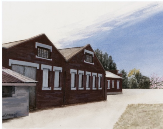
Midday at the Mill (2022) Mixed media on paper, 37 x 43 cm framed $700