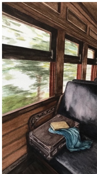
Passenger, Second Class (2022) Watercolour on paper, 51 x 35 cm framed $900

Also available: Limited edition giclee print, edition of 40, signed and numbered by the artist, archival ink on Hahnemuhle Photo Rag 188gsm, 51 x 61 cm $300