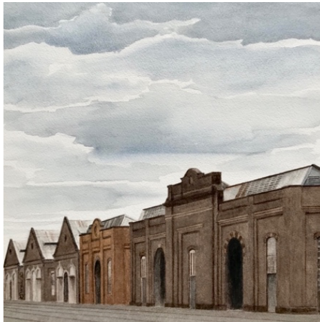
Hard Day's Work (2022) Watercolour on paper, 48 x 48 cm framed $900